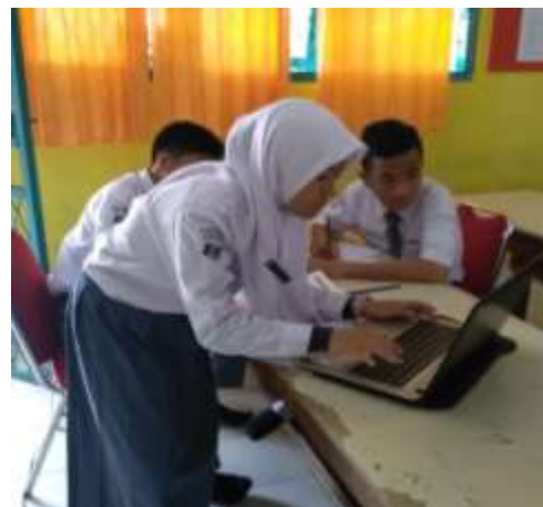
Figure 4. Data interpretation use Ms. Excel

In addition in the work and discussion in groups, researchers allow students to use Ms.Excell and calculators as calculation tools. From the results of students' answers, the researchers saw the students' interest in working on LKPD 1 and 2 in their work on the problems of financial concepts presented. Plus the comments of students from the results of the interview responded positively. So from the presentation and expected results stated that the LKPD has practicality and is easily understood by students in these small groups.