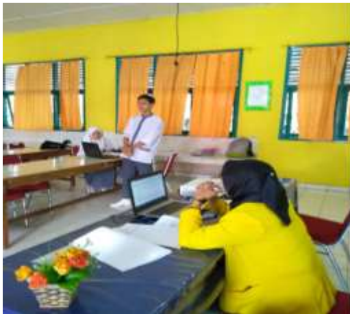
Figure 3. Describe the variables